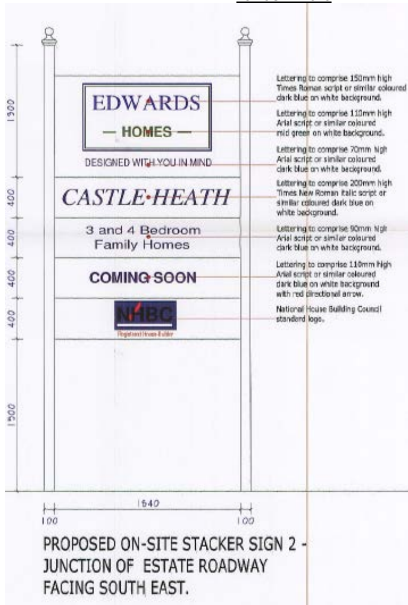
Figure 2. Sign 2