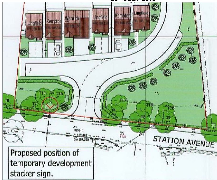
Figure 3. Signage Location

Conservation Area: The Council's conservation officer raises no objections to the temporary hoardings provided that the proposed siting will not result in any adverse impacts upon the adjacent trees.